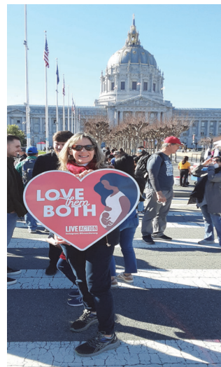
West Coast Walk for Life (San Francisco) January 21, 2023

On page 4, read about our recommended pro-life book, as well as upcoming outreach events Teachers Saving Children® Inc. members will be attending in the next few months.