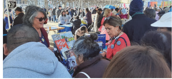
Our exhibit table attracted many!