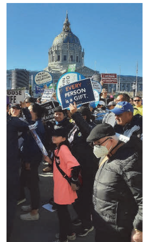
All Ages Walk for Life in San Francisco