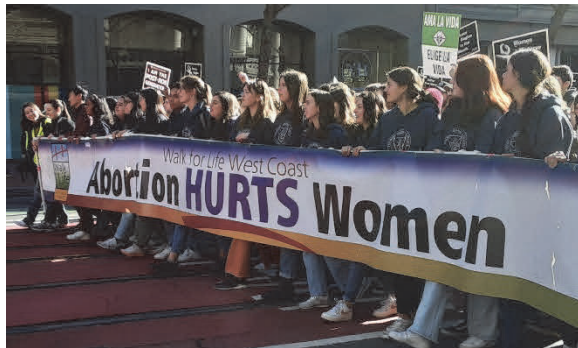
The Pro-Life Generation, Lead the Walk for Life

"For the first time, we stand together at the Walk for Life West Coast in a country where the so-called 'right' to kill an unborn child is no longer the law of the land. This is a battle we have been fighting for 50 years. Tomorrow (January 22, 2023) WOULD HAVE BEEN the 50 th anniversary of the atrocity of Roe v. Wade. Thanks to pro-lifers and to God Almighty, Roe will NOT HAVE a 50th birthday. And what that means is many thousands of children WILL HAVE a FIRST birthday!"