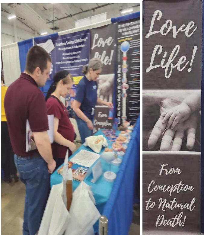
Attendees visit our exhibit at CHAP Convention