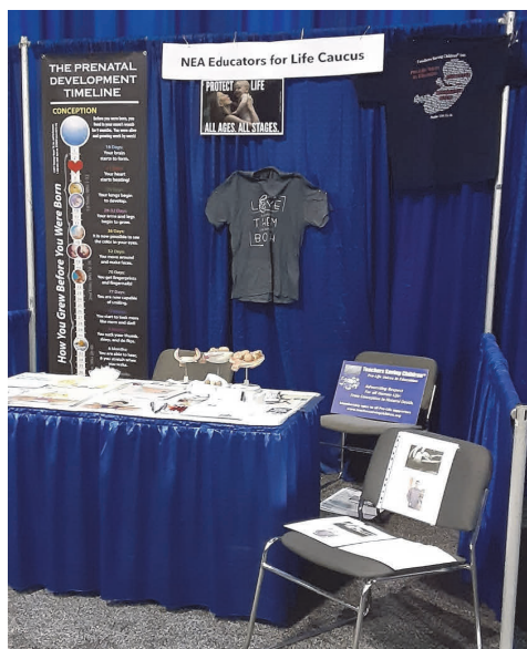
NEA Educators for Life Caucus sponsored Teachers Saving Children