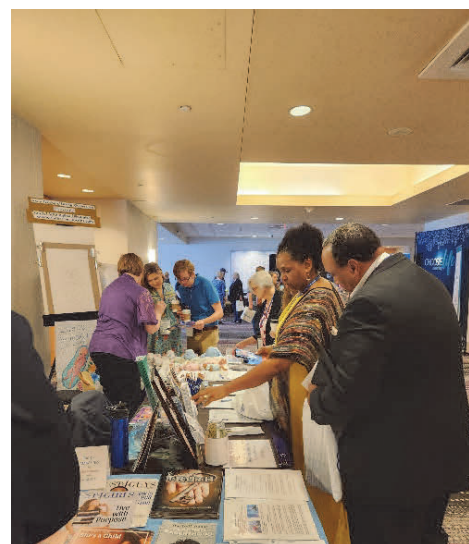
Teachers Saving Children exhibit table

Thanks to you, our members, you made this a resounding success!