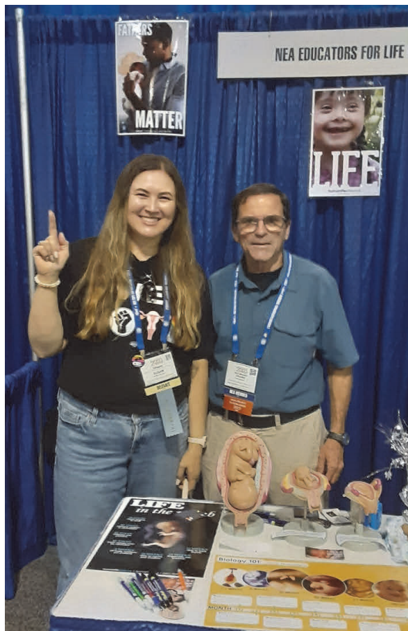
Frank and NEA-RA delegate happy to be pro-life

“Light shall shine out of darkness.” –2 Corinthians 4:6