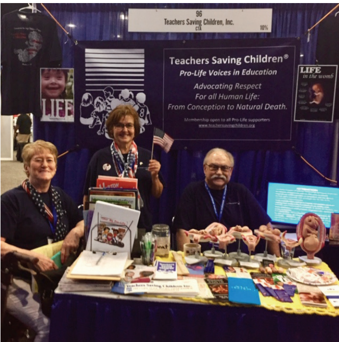
July 4 th : On Independence Day, remembering our unalienable rights, including the right to life .