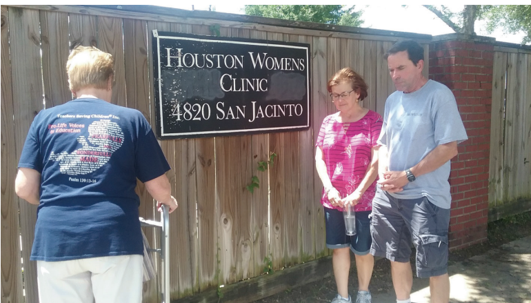
July 8 th : Praying outside Houston Women's Clinic