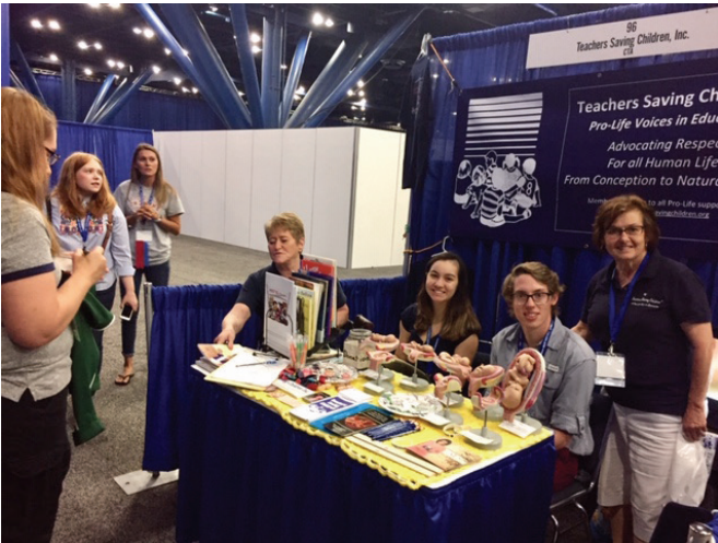
July 3 rd : Teachers Saving Children and Texas Right To Life guest volunteers