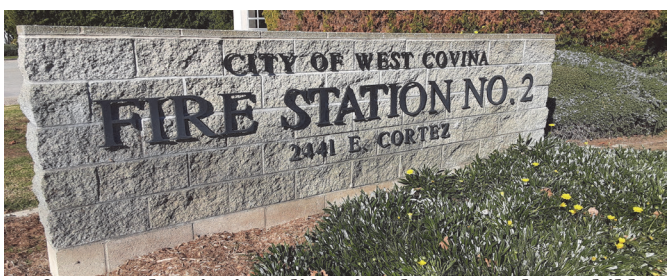
Safe Surrender Site in California where a newborn child was saved from an abortion

Barrett, a mother of seven children, including two of whom are adopted, asked the attorneys challenging Mississippi's law whether adoption and/or safe haven laws would reduce the "burden of parenthood", a term used to justify abortions in the 1992 Planned Parenthood v. Casey U.S. Supreme Court case. Safe Haven/Surrender Sites typically are located at hospitals, fire stations, police statons and churches. More than 1,000 babies have been saved in California since a safe surrender law was enacted in 2001.