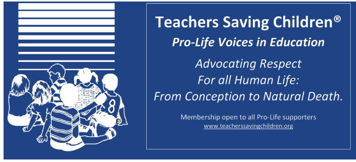
Teachers Saving Children 12" x 18" sign