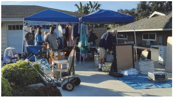
Yard sale money helps local pregnancy center.